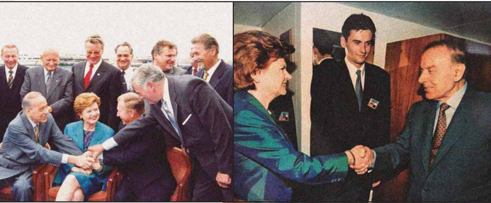
Yalta summit (September 9, 1999)

“Heydar Aliyev was born 2 years after the loss of independence the first independence of Azerbaijan he grew up when he spent his career as a very talented statesman and organizer and administrator under a system which was the only one available to him and that was a Soviet system.