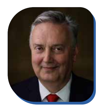
Zlatko Lagumdzija Prime Minister of Bosnia and Herzegovina 2001–2002